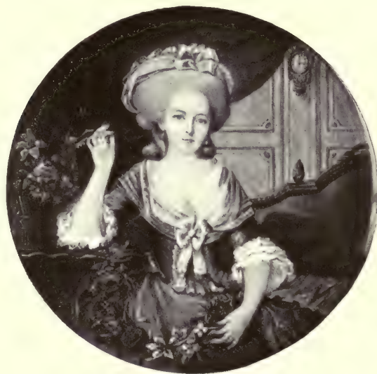
LA PRINCESSE DE LAMBALLE (Ob. 1792) BY P. A. HALL